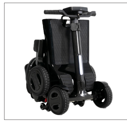
Conveniently Folds for Easy Portability and Storage