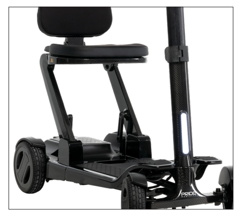
Light-weight Carbon Fibre Frame