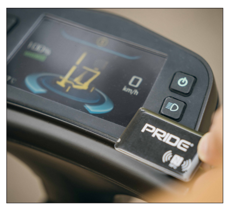
Vibrant Colour Display on Console with NFC Ignition Security